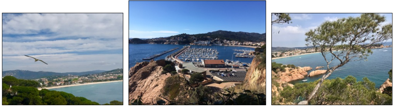
a view of Sant Pol

We are ideally located outside the tourist madness but less than 20 minute walk (4 minute bike or car ride) between two of the most beautiful beaches in Costa Brava — Sant Feliu de Guixols and Sant Pol. In either direction, along the way, you'll discover miradors (scenic overlooks) and gorgeous calas (coves). Natural beauty and architecturally-stunning villas are yours to marvel at along the Camino de Ronda between Sant Pol and Sa Conca. Medieval towns, old fishing villages, archeological sites, museums, wineries, local cuisine and crafts... so much to explore in this part of Empodá!